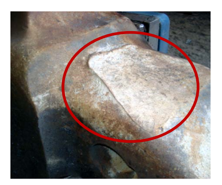
S-Series Posilok nose with severe wear and deformation caused by using a Hensley adapter

ESCO's Posilok Plus System is a leader in mining tooth technology. All components are carefully designed to work as an assembly for optimum performance and long life.