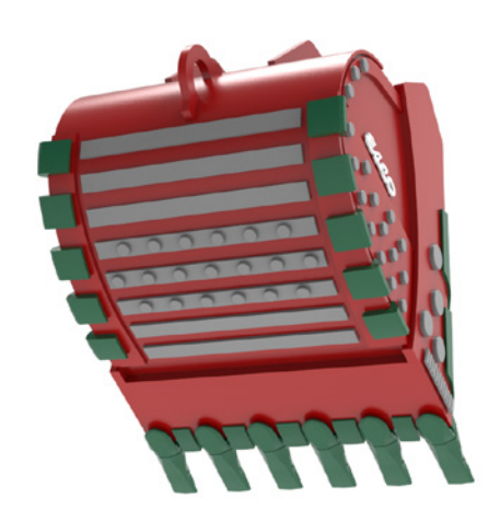
Back Wear Protection Options