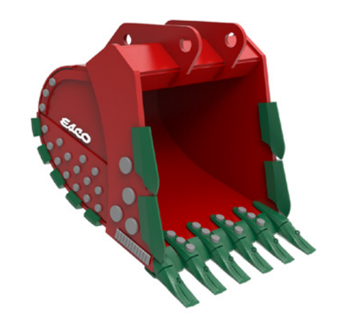
Side and Lip Wear Protection Options

Following are sample configurations of side and back wear protection options. Packages include AR plate liners and wear strips, Infinity® bi-metallic buttons and blocks (chrome white iron), cast corner wear shoes, and Toplok® lip and wing shrouds.